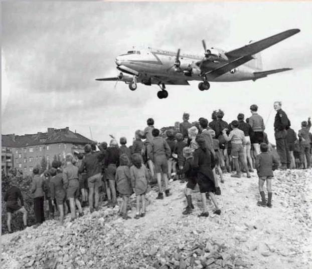
BERLIN AIRLIFT, 1948 - An American C-54 transport aircraft about to land at Tempelhof Airport during the Berlin Airlift, 1948.

The west saw this as an attempt to starve Berlin into surrender, so they decided to supply west Berlin by air.