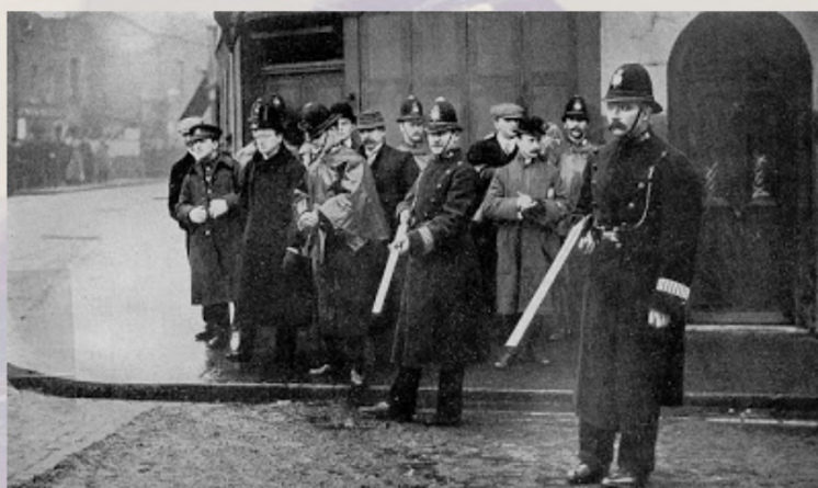
MR. WINSTON CHURCHILL AT THE SIEGE OF SIDNEY STREET

In no more than 75 words, explain what you think the main issues were for the police that emerged from the Siege of Sidney Street.